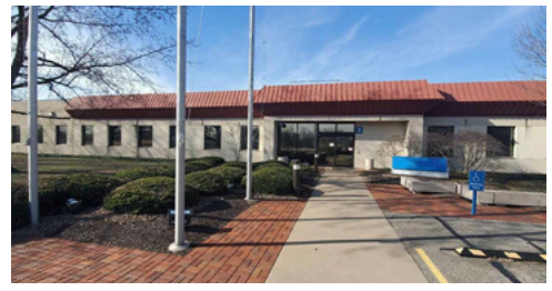
AUBURN - 201 BRANDON ST 329,348 SF DIVISIBLE LESS THAN 1 MILE FROM I-69 FOR LEASE