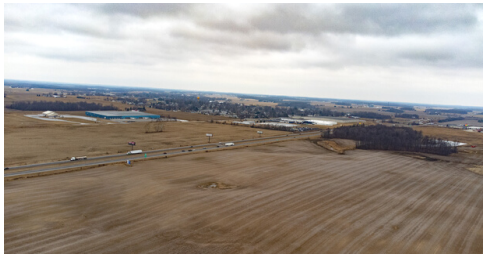
ASHLEY - I-69 DEVELOPMENT OVER 180 ACRES RIGHT OFF INTERSTATE EXIT 340 THE KLINK GROUP & JICI CONSTRUCTION DESIGN & BUILD