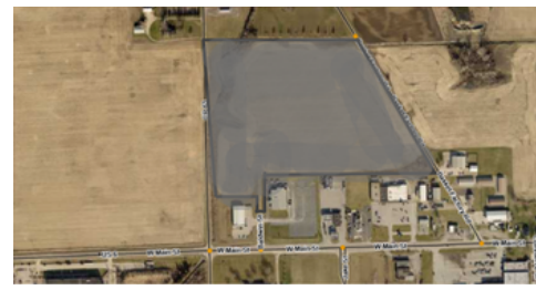
BUTLER - HIGHWAY 6 PROPERTY 29 ACRES INDUSTRIAL ZONING FOR SALE