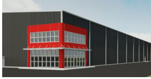
GARRETT - CR 19 SPEC BUILDING 50,000 SF SPEC BUILDING COMING FALL 2023 CLOSE TO I-69 FOR LEASE