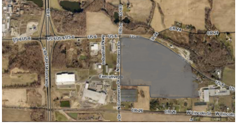
WATERLOO - US 6 & CR 31 OVER 100 ACRES RIGHT OFF INTERSTATE EXIT FRONTAGE ON US 6