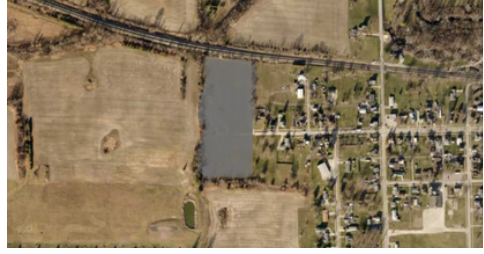
ST. JOE - DEVELOPMENT LAND 7.3 ACRES OWNED BY TOWN OF ST. JOE FOR SALE