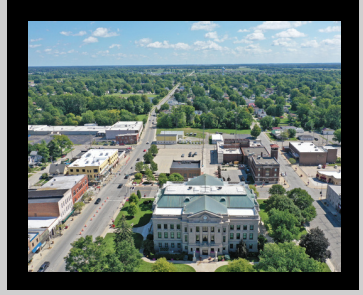
SITE SELECTION MAGAZINE (MAR 2023)

Auburn Named Top 5 Micropolitan 2021, 2022 & 2023